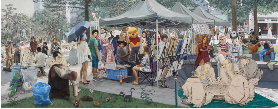
Artistic Afternoon _ Oil on canvas _ 233.6 x 91 cm _ 2017

We learn about many artists who are already famous in art history. About their lives and works. Their recorded lives and paintings are great. To borrow a title of a artist's work, beg, endure, or become greater. People recorded in history will surely belong to the great side of the three. We encounter their lives and work indirectly through books, exhibitions or documentary films.