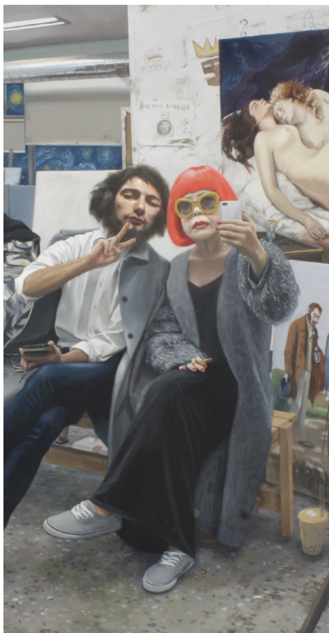
Selfcamera of Gustave Courvet (局部圖)