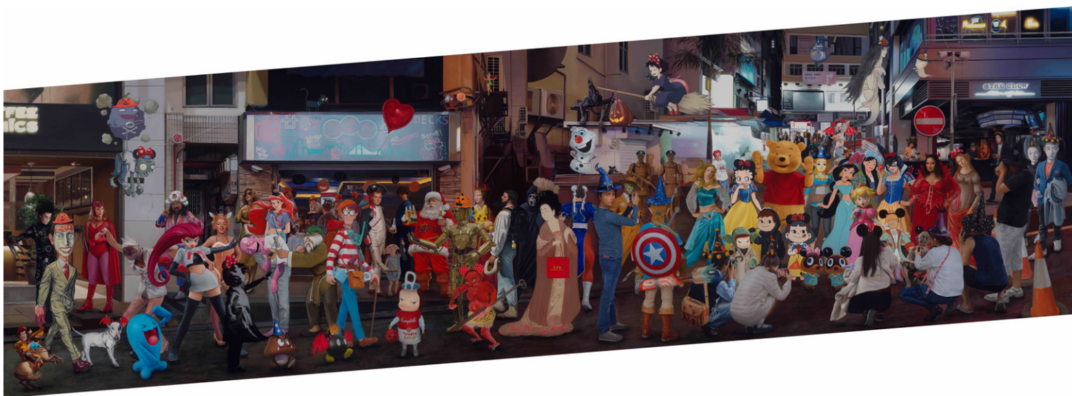
權能 Kwon Neung Artistic Halloween 2023