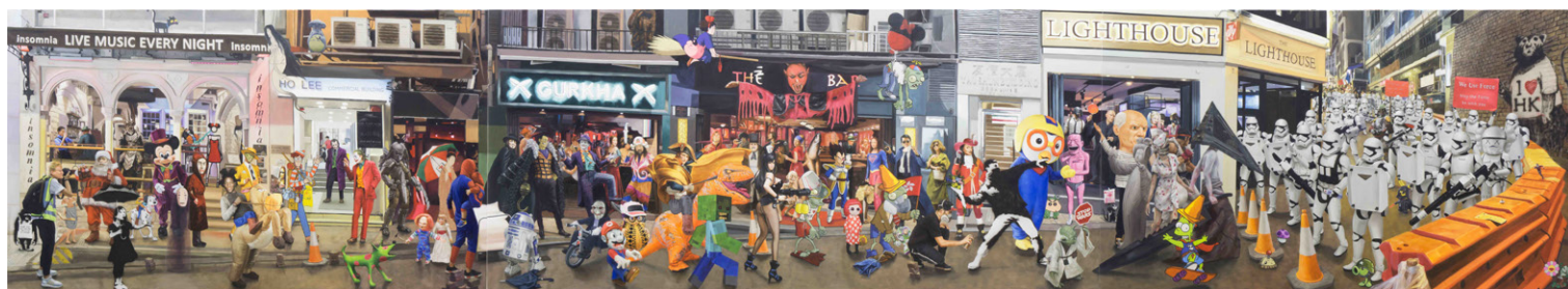
權能 Kwon Neung Artistic Halloween 2020