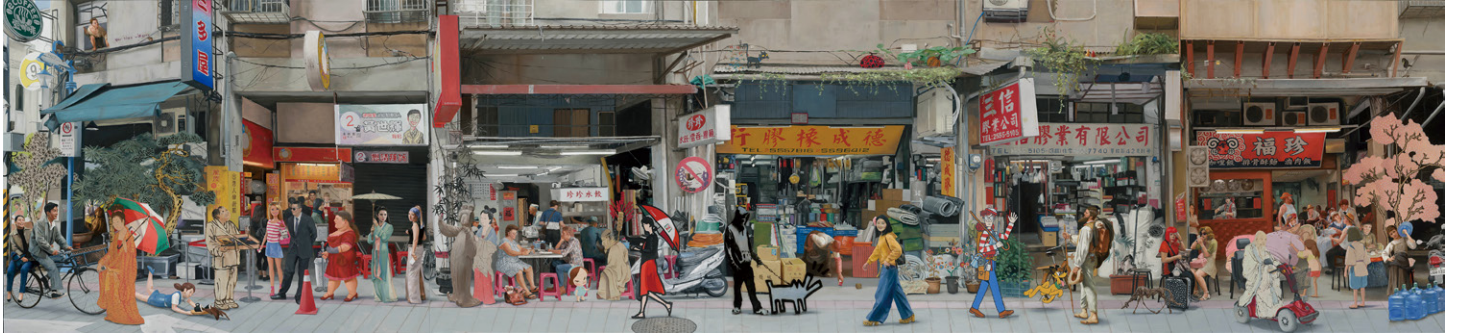
↑ Artistic Street (2) _ Oil on canvas _ 90 x 390 cm _ 2019