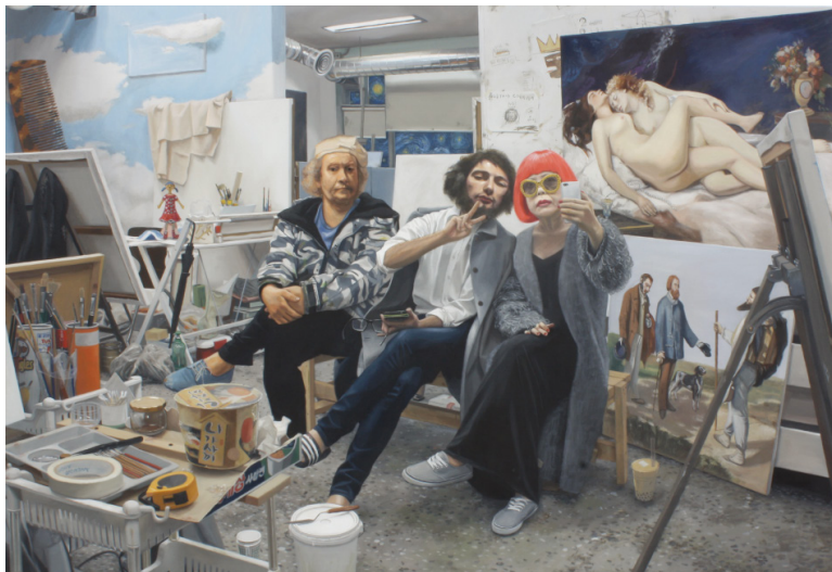
Selfcamera of Gustave Courvet _ Oil on canvas _ 116.8 x 80.3 cm _ 2016

權能擅長挪用現今的通俗符號以及套入美術系學生的日常生活，將這些特定時代的偉大藝術家重新詮釋一遍，也將歷史和當代並置在一個空間之中同時發生。然而，權能以寫實的繪畫技巧臨摹各時期的名作與相異的藝術風格，卻能將主角與環境之間產生一種相呼應的關係，形成當代藝術流行的混搭風格。作品中除了呈現時間的更迭或是身份的轉變外，他也向社會反映現在韓國美術系學生面臨的狀況。就這個多元化的時代來看，我們確實很難以單一的藝術風格去描繪這個世界的變遷。而在流行、經典與文化的交織下，權能利用詼諧幽默的元素創作時，除了當代藝術與生活之間出現密不可分的關聯，對於觀眾來說，也具有真實感受的對話。