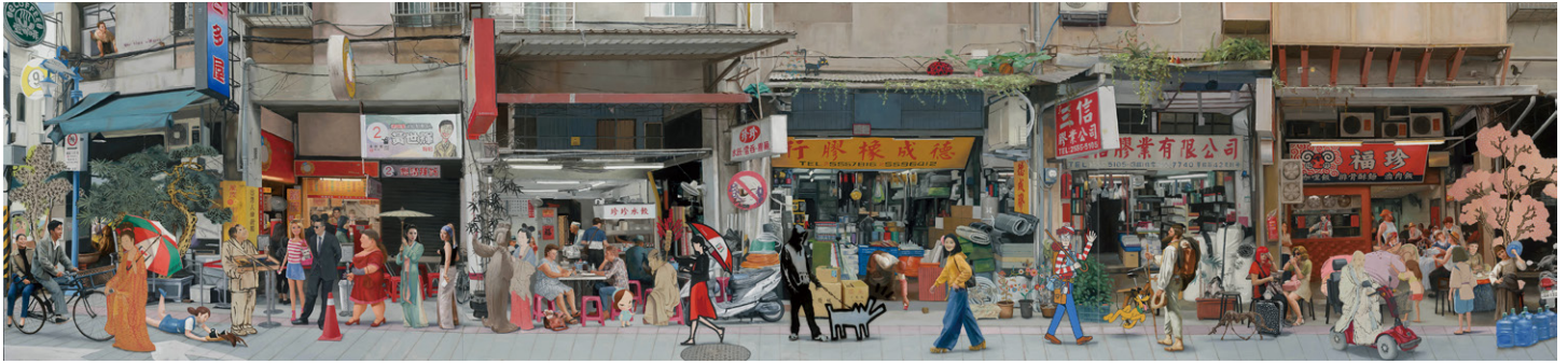
↑ Artistic Street (2) _ Oil on canvas _ 90 x 390 cm _ 2019